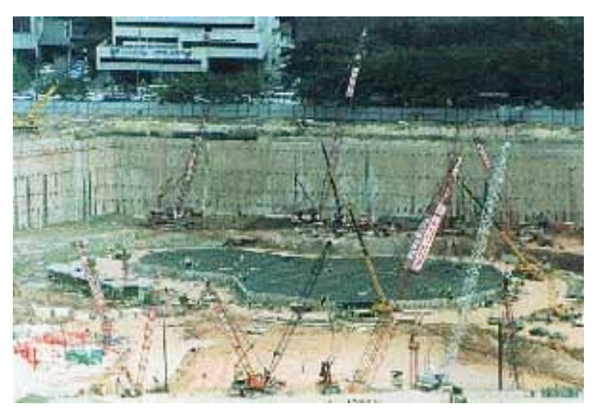
The foundation took one whole year to complete; every step of its construction was a technological breakthrough.

The Twin Towers were planned to be built on the site of the former Selangor Turf Club which was flat, green land. But soil studies showed that the site where the buildings were originally planned for, proved unsuitable for the foundation due to the irregularities of the limestone bedrock below that's known as Kenny Hill soil.